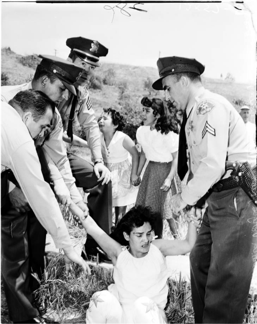
Fig 2. Chavez Ravine Evictions , by Snow and Paegel, 1959.