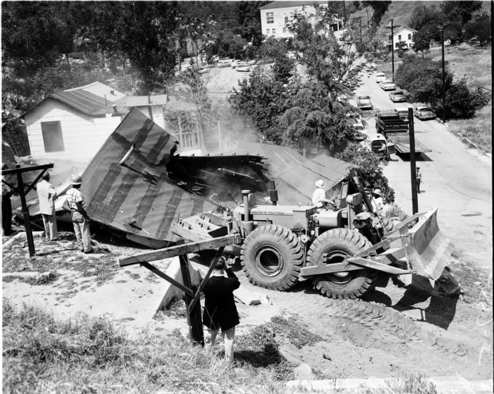
Fig 3. Chavez Ravine Evictions , by Miller, 1959.