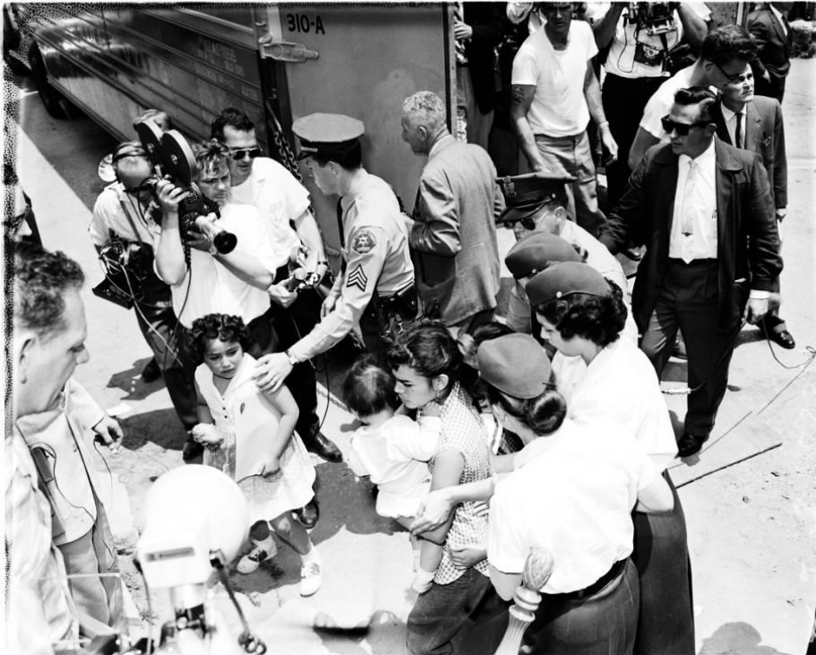
Fig 1. Chavez Ravine Evictions , by Miller, 1959.

and Lincoln Heights illustrates the qualities of thriving sites of resistance that hold significant potential for social emancipation.