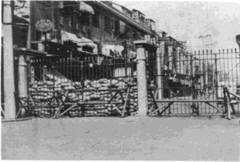
Ouvrages de défenses aux limites de la Concession